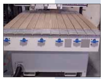
Individual zones run the length of the table.

on the market today. Techno understands that fixturing parts can be the most complex part of the manufacturing process, in addition to being time consuming. With Techno's vacuum table, we allow for both mechanical and vacuum fixturing to be used simultaneously. What does this mean? If you are processing sheets of material such as MDF, Melamine, plastic, foam or any other sheet-like material, vacuum flow-through process is an excellent solution. If you are processing small or irregular shaped products, then you may want to utilize vacuum along with mechanical clamps. With Techno's universal vacuum table, you can achieve both. With the T-Slots built into the aluminum vacuum table, it is easy to mount gates for banking your material against, lining the material up square to the axis of travel. In addition, Techno's vacuum tables are zoned. If you are processing small parts, then you do not require the entire machine's vacuum table to be wide open, rather, just a small section. Techno's vacuum tables are also easily customizable. Techno's vacuum tables are channeled, which allow gasketing material to be routed around the vacuum table. The channels cut into the table are placed on a 1.0" grid; therefore, the gasketing can be formed to any pattern to fixture small parts. In areas along the open zone where vacuum is not required, simply utilizing the rubber plugs will close off the other vacuum ports in the zone. This flexibility makes the job easier and setup minimal.