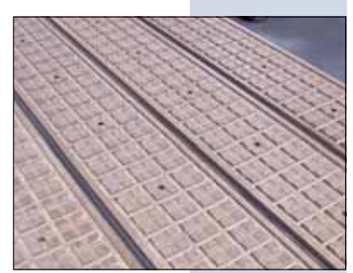
Grid pattern offers maximum flexibility and provides easy customization of table surface.