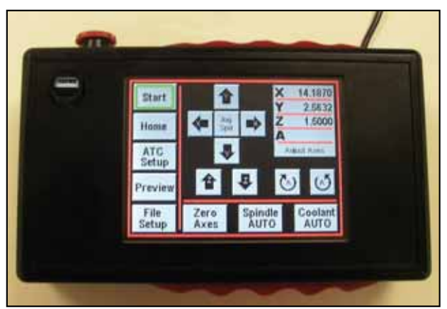
Techno CNC Interface Main Screen on A.R.T.