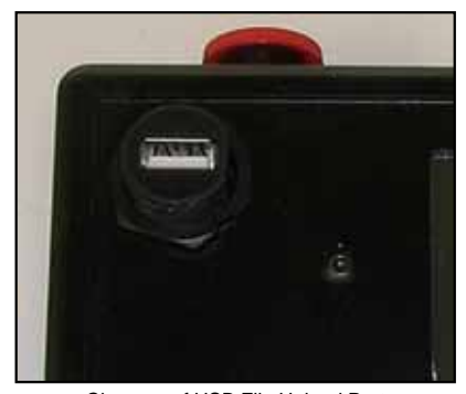
Close-up of USB File Upload Port