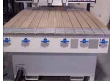
Individual zones run the length of the table.

on the market today. Techno understands that fixturing parts can be the most complex part of the manufacturing process, in addition to being time consuming. With Techno's vacuum table, we allow for both mechanical and vacuum fixturing to be used simultaneously. What does this mean? If you are processing sheets of material such as MDF, Melamine, plastic, foam or any other sheet-like material, vacuum flow-through process is an excellent solution. If you are processing small or irregular shaped products, then you may want to utilize vacuum along with mechanical clamps. With Techno's universal vacuum table, you can achieve both. With the T-Slots built into the aluminum vacuum table, it is easy to mount gates for banking your material against, lining the material up square to the axis of travel. In addition, Techno's vacuum tables are zoned. If you are processing small parts, then you do not require the entire machine's vacuum table to be wide open, rather, just a small section. Techno's vacuum tables are also easily customizable. Techno's vacuum tables are channeled, which allow gasketing material to be routed around the vacuum table. The channels cut into the table are placed on a 1.0" grid; therefore, the gasketing can be formed to any pattern to fixture small parts. In areas along the open zone where vacuum is not required, simply utilizing the rubber plugs will close off the other vacuum ports in the zone. This flexibility makes the job easier and setup minimal.