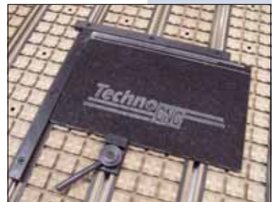
Techno offers a number of clamps and accessories for the vacuum table. See below.