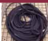
HX4892-W0002 (40 ft/bag)