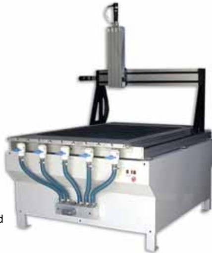
Shown with optional stand and vacuum table